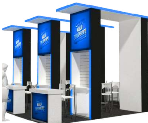
*reference image, Startup Pavilion

Includes exhibitor badges (3 per 9 sqm), unlimited visitor pre-registration code for your company and mention in the directory. Does NOT include carpet, construction, furniture, or services.