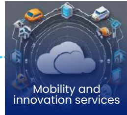
Mobility and innovation services