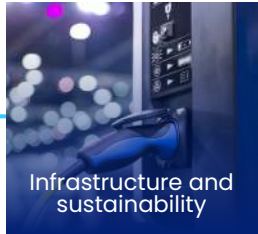
Infrastructure and sustainability