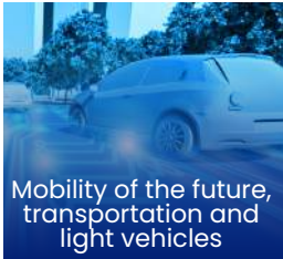
Mobility of the future, transportation and light vehicles